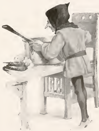
The dwarf prepared the food.

“Well,” said the steward, “I would not have believed it possible; but by all means let him have the things he asks for, and see how he will manage to prepare the breakfast.”